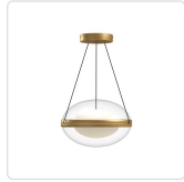
PD76312-BG/OP0-UNV Brushed Gold/Opal Glass