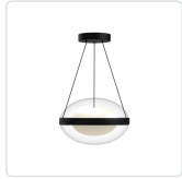
PD76312-BK/OP-UNV Black/Opal Glass